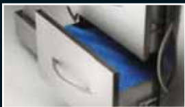
Storage drawers (RSB Models)