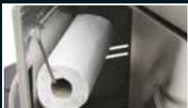
Additional storage space and a convenient paper towel holder