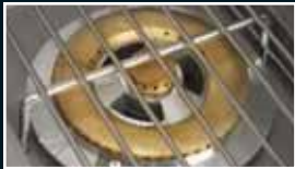
Built-in side burner (RSB model) for added cooking space and heat for versatile cooking and side dishes