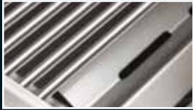
Exclusive stainless steel rod cooking grids & sear plates