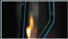
INSTA-LITE™ flame ignition system and stainless steel tubular burners