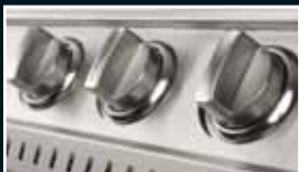
Stylish EASYSET™ knobs for precise heat control