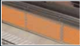
Ceramic infrared rear rotisserie burner